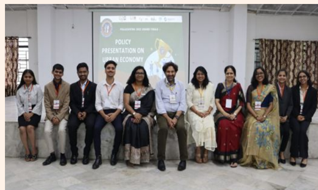
Still from Policy Presentation Event

The participants came from metropolises such as Delhi, Mumbai Kolkata but also smaller cities such as Hubli-Dharwad. The most common aspect that they talked about was boosting the tourism sector. There were also highlights on carbon credit systems and e-bikes to ensure sustainable economic development.