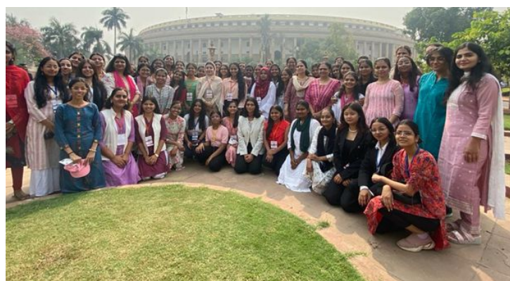
Stills from Parliament Visit