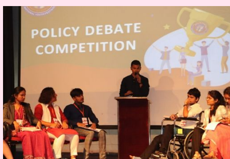
Still from Policy Debate Event

The motion; 'Should City Government only be a Service Delivery Agency or whether they are responsible for Economic Development' was selected as the debate motion for the grand finale. Participants were divided into Government and Opposition sides to either favour or oppose the motion on spot.