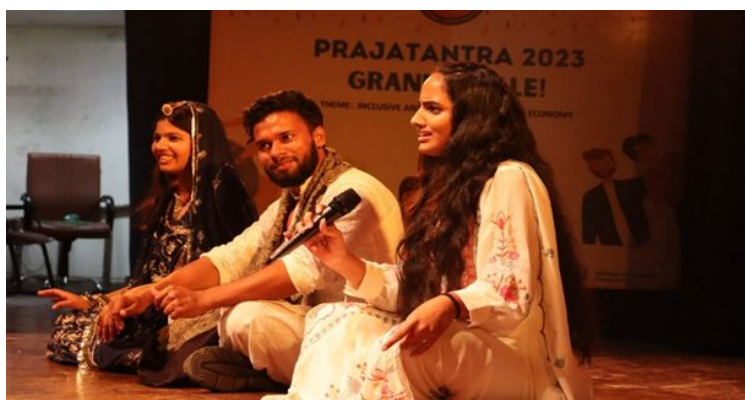
Stills from Cultural Night