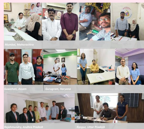
Stills from Field Engagement

Phase II focused on Field Visits and Citizen Surveys, where participants interacted directly with administration officials, elected representatives, and citizens. These interactions provided valuable insights into the implementation of urban economic policies and the effectiveness of service delivery.